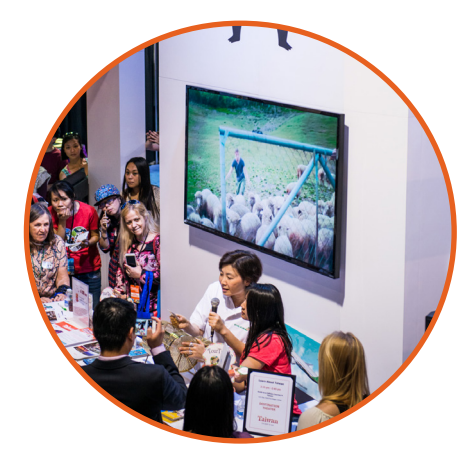
Not only did this exhibitor hold a prize drawing at her booth to attract attendees, she also made the rule that the winner had to be present to receive the giveaway!